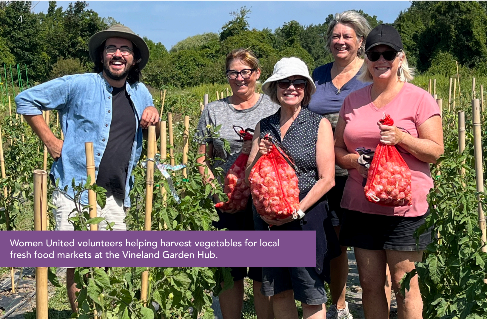
Women United volunteers helping harvest vegetables for local fresh food markets at the Vineland Garden Hub.