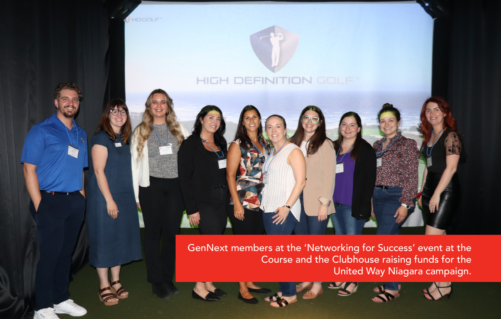
GenNext members at the 'Networking for Success' event at the Course and the Clubhouse raising funds for the United Way Niagara campaign.