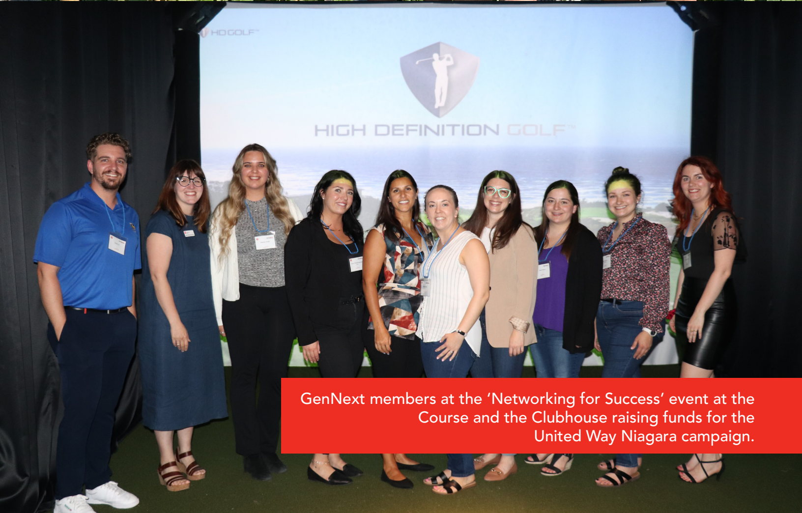
GenNext members at the 'Networking for Success' event at the Course and the Clubhouse raising funds for the United Way Niagara campaign.