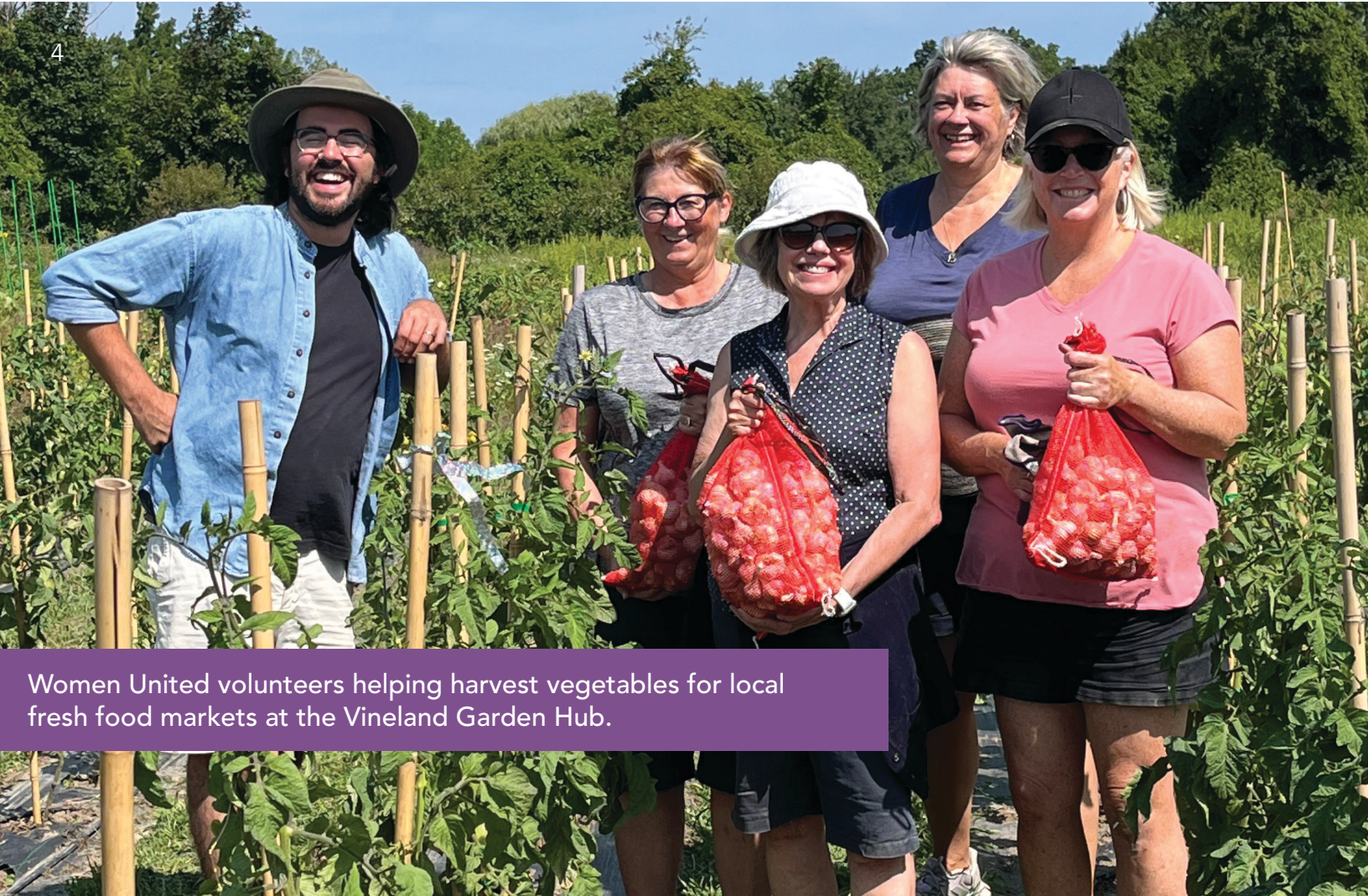
Women United volunteers helping harvest vegetables for local fresh food markets at the Vineland Garden Hub.