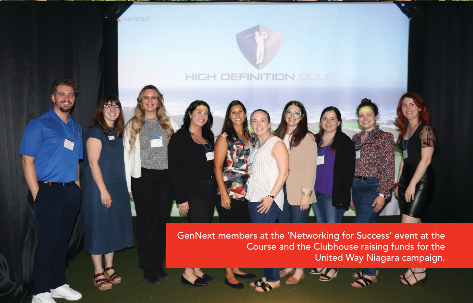
GenNext members at the 'Networking for Success' event at the Course and the Clubhouse raising funds for the United Way Niagara campaign.